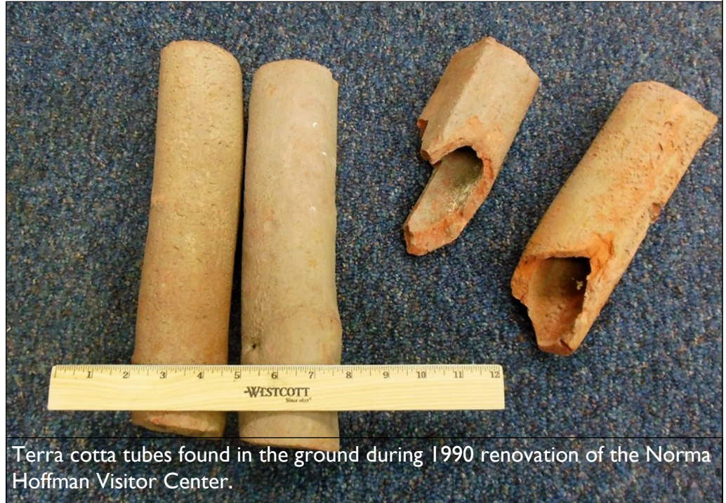
Terra cotta tubes found in the ground during 1990 renovation of the Norma Hoffman Visitor Center.