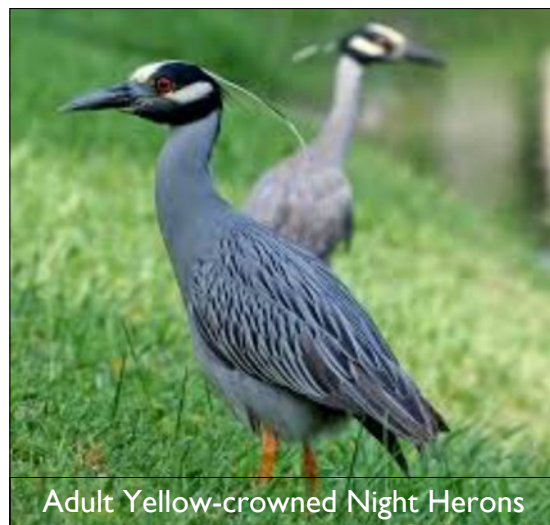
Adult Yellow-crowned Night Herons

The Monday Morning Bird Walk has been a weekly event at Huntley Meadows Park since 1985. It takes place every week, rain or shine (except during electrical storms, strong winds, or icy trails), at 7AM (8AM November-March), is free of charge, requires no reservation, and is open to all. Birders meet in the parking lot at 3701 Lockheed Blvd, Alexandria, VA. Questions should be directed to Park staff during normal business hours at (703)768-2525.