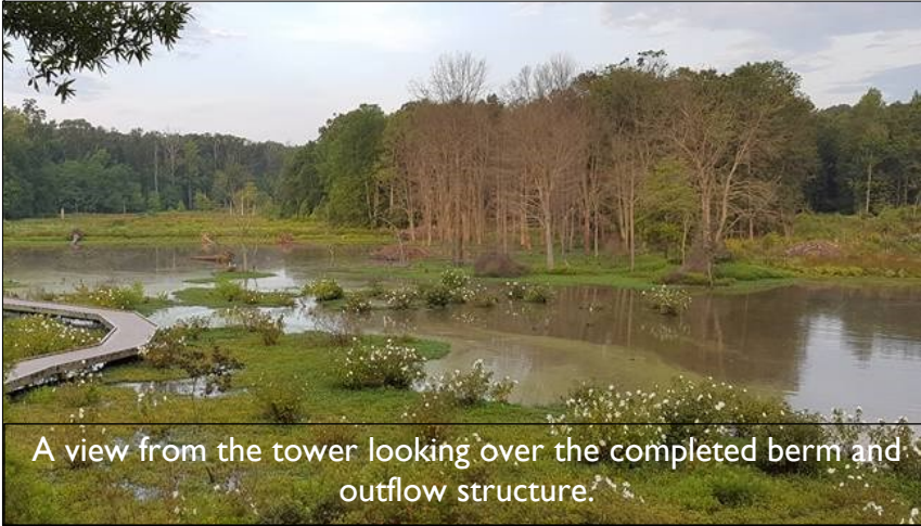
A view from the tower looking over the completed berm and outflow structure.

NACPRO is a non-profit professional organization that advances official policies promoting county and regional park and recreation issues. NACPRO provides its members with opportunities to network, exchange ideas and best practices, and enhance professional development.